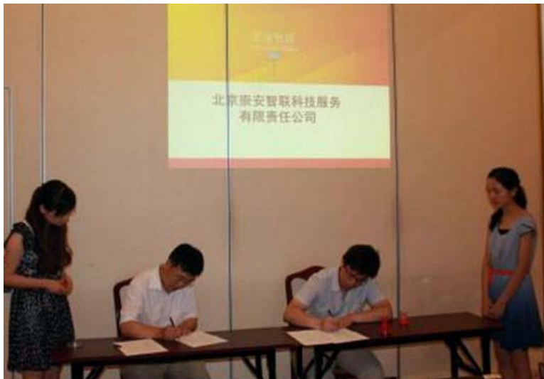
SRA-China and Beijing Cazl Technology Service Co., Ltd., signing the Overall Cooperation Agreement

In June, the Development Department realized a road-condition model in an experimental IOI, bringing forward concepts of a demand customization tool, experience express tool, and experience zoning map of the online version. It provides an important entity product model to achieve the goal of experience service in IOI. The road-condition model product is being developed, and we expect forms and services to be online at the end of this year.