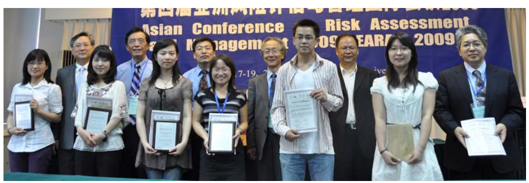
SRA-Japan Student Award Ceremony

We are also organizing our first SRA-LA regional meeting, to be held in April 2010. We expect that this very first region-wide activity will get current and prospective members of SRA-LA to-