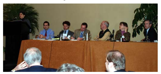
"New Ideas in Risk Regulation" Roundtable

We also co-sponsored a roundtable with the Economics and Benefits Analysis Specialty Group. The roundtable was a follow-up to our co-sponsored conference in June titled "New Ideas in Risk Regulation."