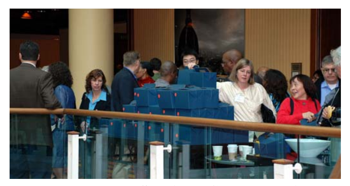
Box Lunch and Specialty Group Meetings