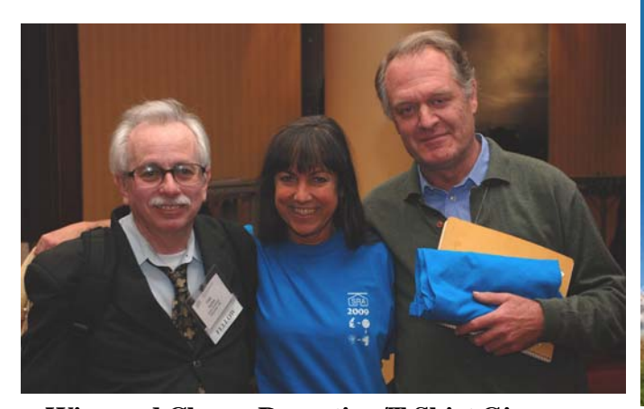
Wine and Cheese Reception/T-Shirt Giveaway