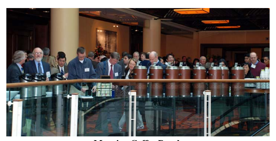
Morning Coffee Break