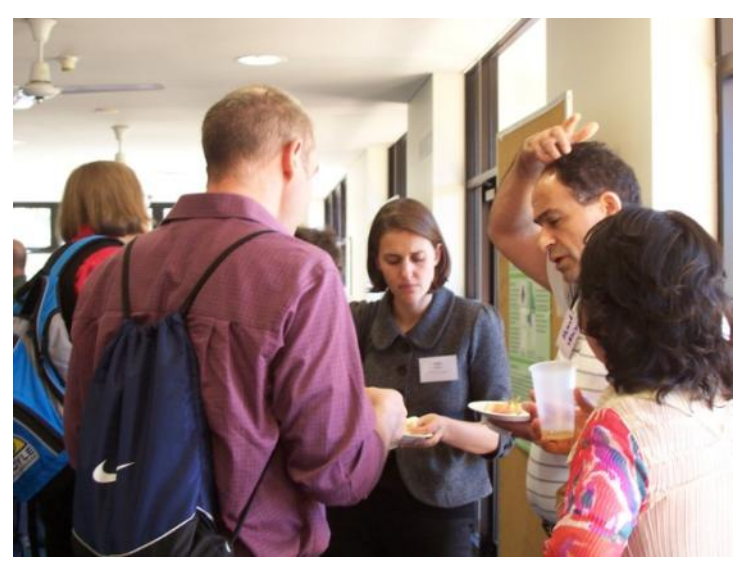
Taking a break during the SRA-ANZ 5<sup>th</sup> Annual Conference