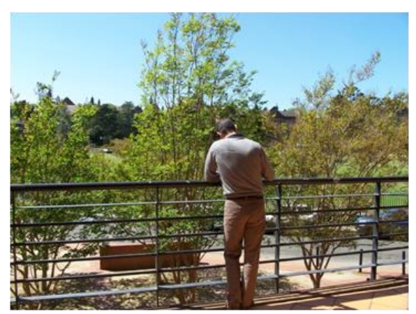
View from Veterinary Science Conference Centre, University of Sydney Site of the SRA-ANZ 5<sup>th</sup> Annual Conference

SRA-ANZ held its 5<sup>th</sup> Annual Conference on 28-29 September in Sydney, Australia (the programme for the conference can be viewed at http://www.acera.unimelb.edu.au/sra/news.html).