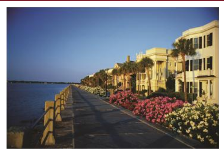
The Battery in Charleston