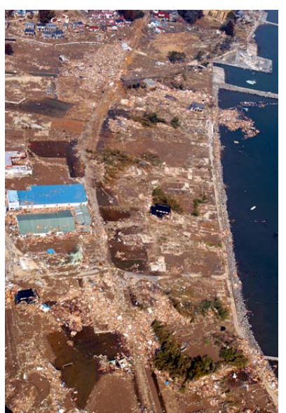
An aerial view of tsunami damage in an area north of Sendai, Japan, taken 13 March 2011.

two discussants. Among 64 papers presented in this meeting, more than half of the papers were on the subjects related to the Great East Japan Earthquake. Members of our Society are working enthusiastically now in elucidating the fundamental causes of the tragedy, in strengthening risk/crisis management, and also in implementing effective risk/crisis communication. Some researchers have been working in the suffering areas in collaboration with people there, and others are supporting in the background. Last summer, SRA-Japan established a special committee to cope with issues related to the Great East Japan Earthquake.