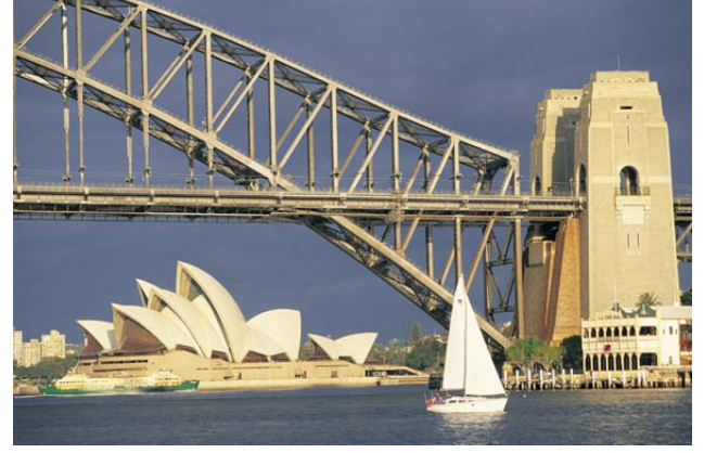
Sydney Harbor Bridge and Opera House

Registration is now open! Please visit <a href="http://sra.org/worldcongress2012">http://sra.org/worldcongress2012</a> and