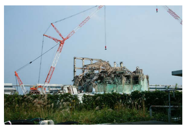
Cranes erected near Reactor Unit 3 at TEPCO's Fukushima Daiichi Nuclear Power Plant.

It has become clear that in relation to earthquakes and tsunamis as actual phenomena, we lack adequate scientific knowledge concerning damage prediction itself as the basis for disaster-prevention measures. Major revisions will be needed in assumptions concerning the scale and spread of disasters. Meanwhile, two nuclear power plant sites in Fukushima Prefecture experienced unanticipated circumstances, with even more serious consequences. The Fukushima Daiichi and Daini nuclear power plants are both owned by Tokyo