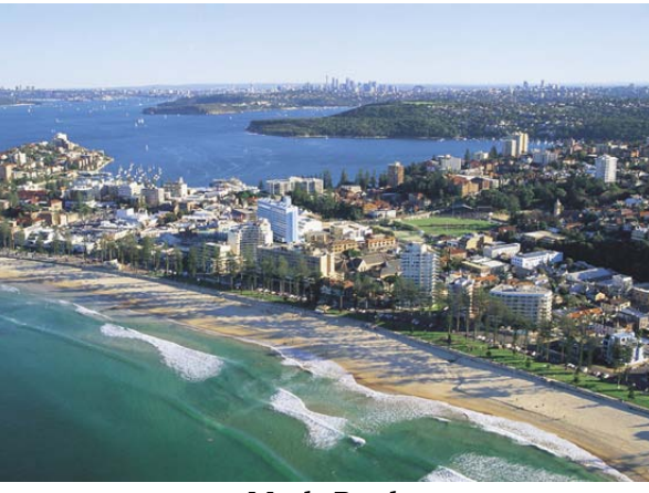
Manly Beach