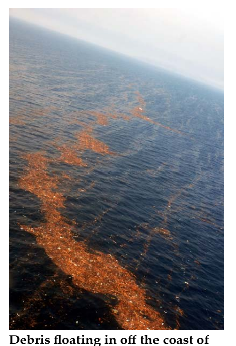
Japan, 13 March 2011.

The Q&A site of SRA-Japan (in Japanese, <a href="http://311sra.">http://311sra.</a> ecom-plat.jp) is a venue for free communication, involving members of the Society in a participatory model. The intention is to support a lively discussion, allowing participants to add new posts and make revisions to their answers as time passes. When a citizen sends in a question, any of the Society's members can voluntarily prepare a response and post it to the site, along with his or her own name and title. The content of questions changes with the passing of time, and the content of suitable responses also changes; therefore, members have the ability to revise their previous posts. The general principle is that Society members decide for themselves which questions they can answer and then assume responsibility for providing answers. When opposing viewpoints exist among members, these can be posted as differing opinions on the same site. This endeavor is still in its early stages because in a serious event such as long-term radioactive contamination, it is important to determine how society's risk perceptions are changing while maintaining risk communication over the long term.