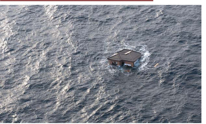
A Japanese home in the Pacific Ocean, 13 March 2011

The disaster has shed light on more issues than just our inadequate understanding of risks from massive natural disasters. We must not overlook the fact that in the study of disaster-prevention measures in the past, problems were caused by the failure to accurately recognize the many uncertainties that are an essential part of the concept of disaster risk itself. For example, concerning storm-surge barriers constructed along the coast of affected areas in the future, debate based on vari-